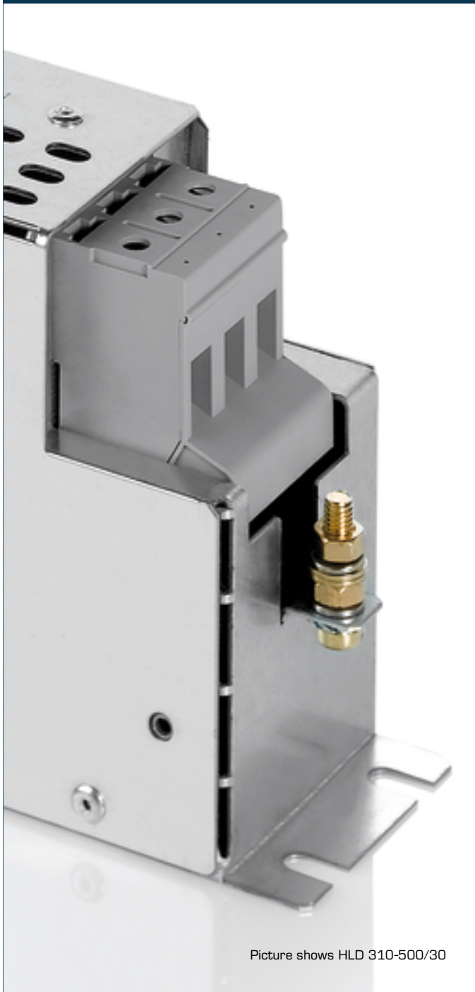
Picture shows HLD 310-500/30